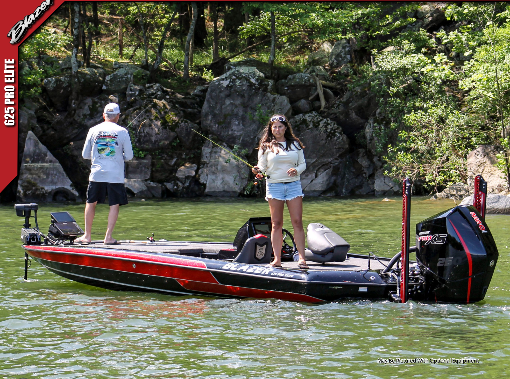
May Be Pictured With Optional Equipment